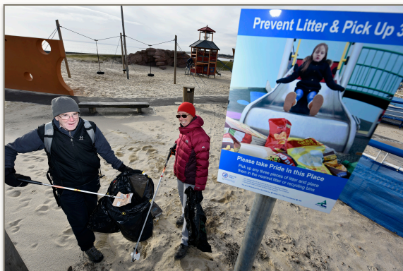
More Information about working together to clean up Angus

Angus is a beautiful place to live and visit and we all have a responsibility to keep the area clean. The Adopt-A-Street Scheme recognises that many residents, businesses and schools take a pride in their area and want to do their bit to help. The Council values that help by providing basic equipment and guidance to make the job easier and safer.